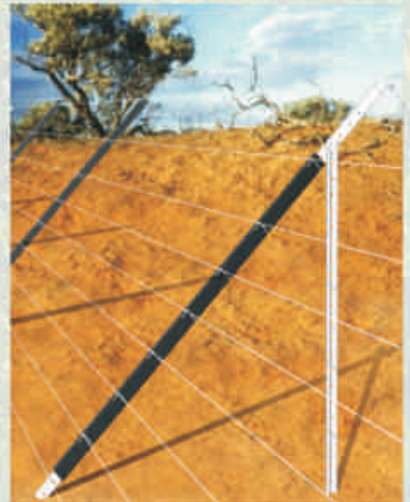
Vermin fence using sloping POLYLOK fence products.