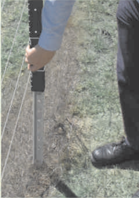
POLYLOK™ fence can be lifted

The POLYLOK™ Stock Fence System uses a range of standardized yet unique fence components. These products easily assemble into a strong and durable fence with heaps of excellent features.