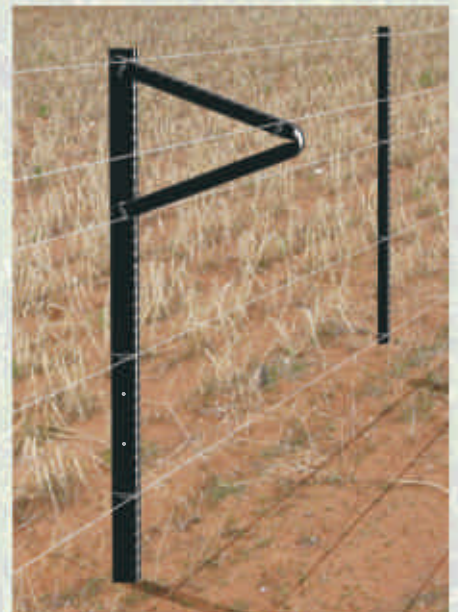
POLY OFFSETTERS clipped to existing wires to support electric offset wire.

YOUR IDEAS - Do you have any great ideas for new fence products, new fence applications or for improvements to our existing product? Contact us and let us know. We would be glad to work with you to make your fencing better. DM Plastics will gladly reward for good ideas.